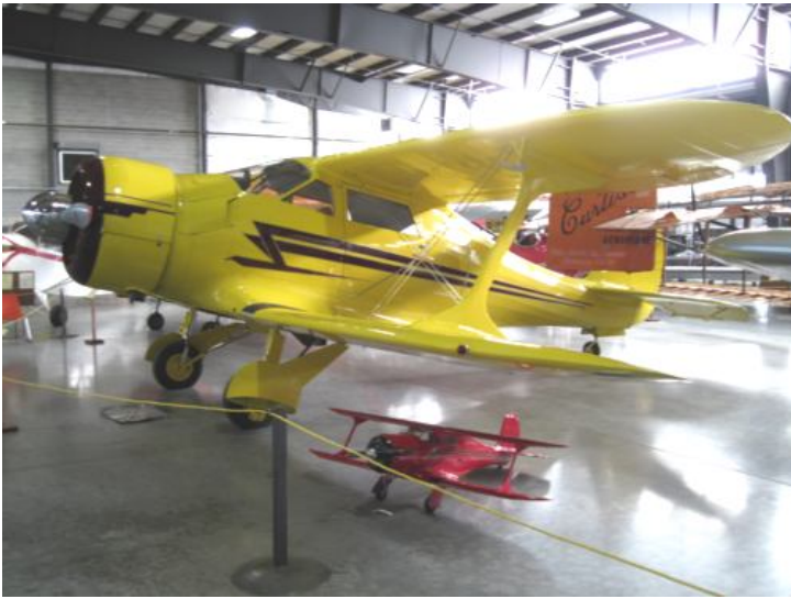
Beech D-17 "Staggerwing"