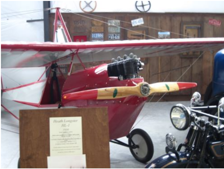
1930 Heath "Longster" "Remember HEATHKITS!"