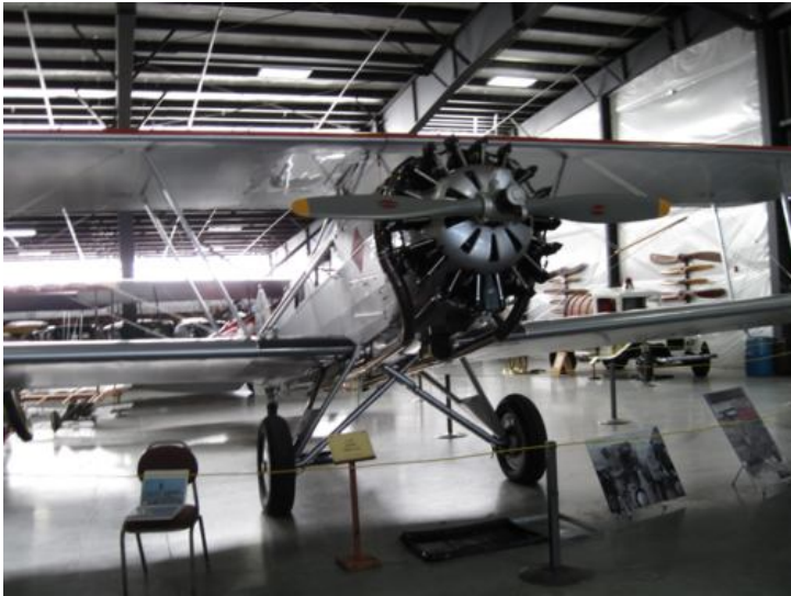
Pemberton & Sons Boeing 40C Mail Plane