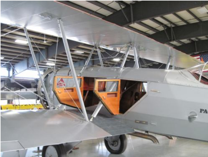
This is the only Boeing 40C in the world!