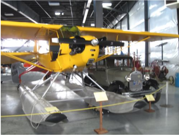
Piper J-3, equipped with EDO floats